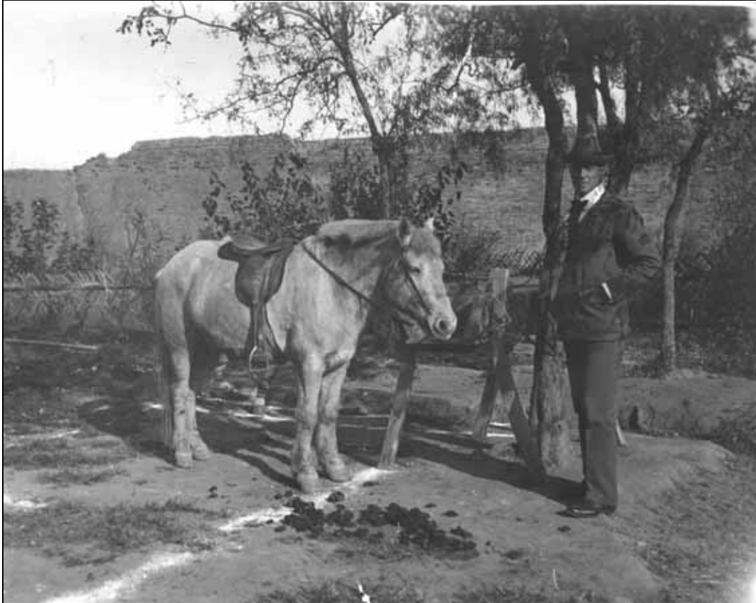
Sharga, with GDW at rear of Wilders' Tungchou compound. City wall is across the moat in the background.